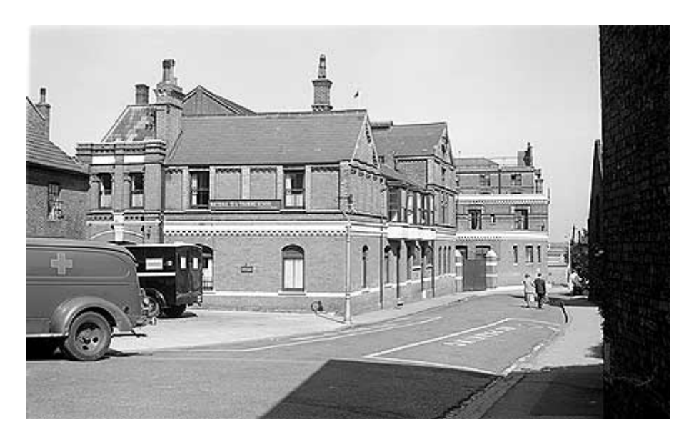
NMR Reference Number: AA001537

In 1963 the National Sea Training Schools became the National Sea Training Trust, and three years later a purpose built college was opened on Chalk Marshes at Gravesend, designed to replace both the old Gravesend Sea School and TS Vindicatrix at Sharpness. This new establishment was called the National Sea Training College. In December 1966 TS Vindicatrix closed and in 1975 the original Gravesend Sea School building was demolished.