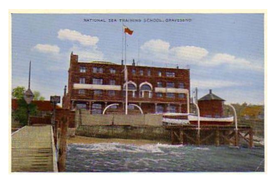
National Sea Training School, Gravesend, Kent

Gravesend Sea School once stood on the site of Wates Hotel, established in 1819 and situated at the western end of Gravesend Promenade. The hotel's most famous guest was Charles Dickens, who stayed there in 1856. By 1865 Wates Hotel was renamed the Commercial Hotel, and by 1882 the Hotel had become a Sailors' Home, acquired by the Destitute Sailors' Rest based in Whitechapel, London who provided food and shelter for shipwrecked and destitute sailors, and for sailors who were not destitute needing somewhere to stay when they were ashore. The premises were eventually handed over to the Government during the First World War and afterwards were sold to the Shipping Federation for their new sea school.