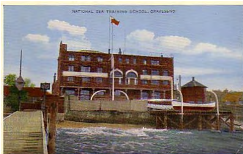
National Sea Training School, Gravesend, Kent

Gravesend Sea School once stood on the site of Wates Hotel, established in 1819 and situated at the western end of Gravesend Promenade. The hotel's most famous guest was Charles Dickens, who stayed there in 1856. By 1865 Wates Hotel was renamed the Commercial Hotel, and by 1882 the Hotel had become a Sailors' Home, acquired by the Destitute Sailors' Rest based in Whitechapel, London who provided food and shelter for shipwrecked and destitute sailors, and for sailors who were not destitute needing somewhere to stay when they were ashore. The premises were eventually handed over to the Government during the First World War and afterwards were sold to the Shipping Federation for their new sea school.